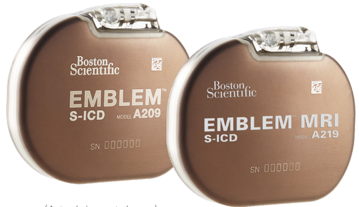
(Actual size not shown)